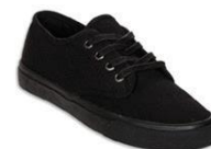
BLACK CANVAS TIE*