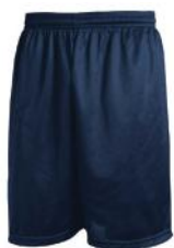
NAVY NYLON SHORTS