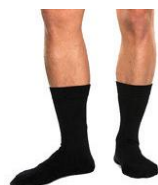
BLACK (NO LOGOS)