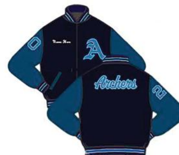
9-12 BOYS LETTERMAN'S JACKET

Formal school uniform sweaters and upper school blazers are acceptable outerwear for the classroom on all days of the week. Archer and House logo wear are acceptable on Fridays after Christmas break, until spring break.