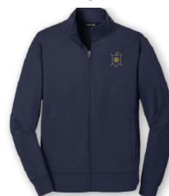
ZIP JACKET (AVAILABLE FROM EDUCATIONAL OUTFITTERS)