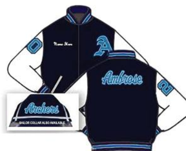
9-12 GIRLS LETTERMAN'S JACKET