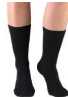
BLACK MID CALF (NO LOGOS)