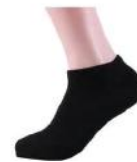
BLACK LOW ANKLE