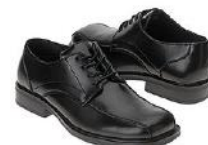
BLACK TIE DRESS SHOE*