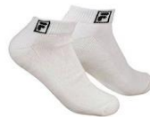
NO LOGOS OF ANY KIND