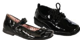
PATENT LEATHER OR SUEDE