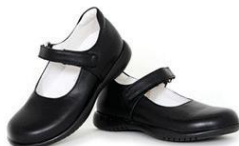
BLACK MARY JANE*