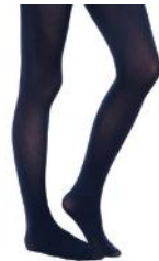
NAVY KNEE SOCKS