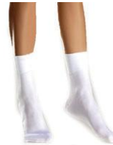
MID CALF FOR K-6TH