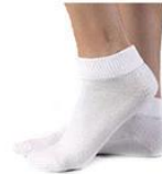
WHITE MID ANKLE