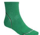
COLORS OTHER THAN BLACK OR KHAKI