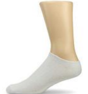
WHITE LOW ANKLE