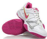
ANY ATHLETIC SHOE WITH A NON-MARKING SOLE