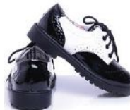
NOT ALL BLACK