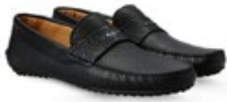
BLACK TEXTURED LEATHER