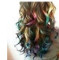
PERMANENT OR TEMPORARY UNNATURAL HAIR COLOR