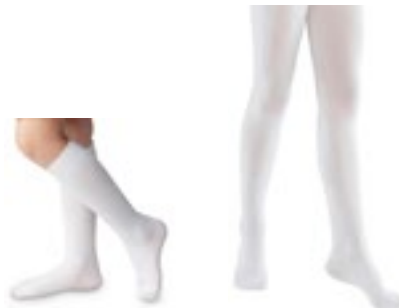
WHITE KNEE SOCKS OR WHITE TIGHTS