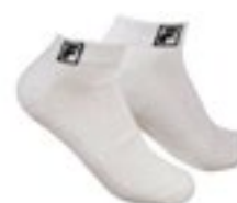
ATHLETIC WITH LOGO