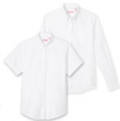
WHITE SHORT OR LONG SLEEVE BUTTON DOWN COLLAR BLOUSE