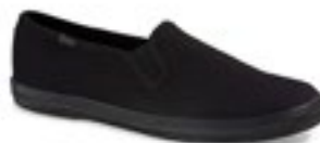
BLACK CANVAS SLIP ON