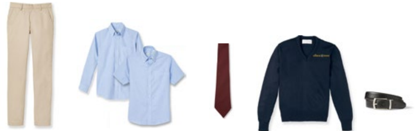
KHAKI TWILL PANTS