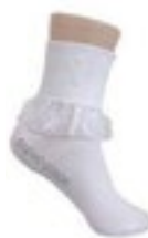
WHITE FOLD OVER WITH LACE OR RUFFLES