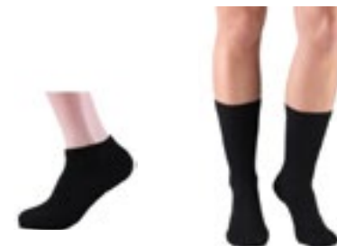
BLACK LOW ANKLE