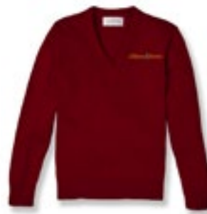
RED V-NECK PULLOVER SWEATER W/SCHOOL LOGO