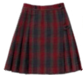
RED/NAVY WRAP AROUND KILT SKIRTS ARE REQUIRED TO TOUCH THE KNEE.*