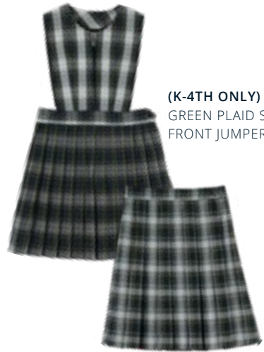
(K-4TH ONLY) GREEN PLAID SPLIT FRONT JUMPER