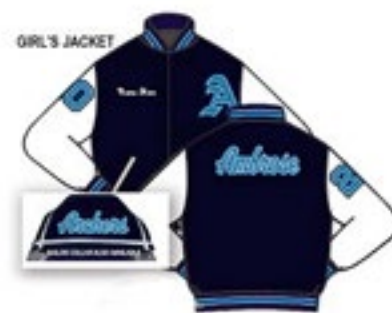
LETTERMAN'S JACKET (Only available to 9-12 students that have lettered in a sport. Order through Jostens. See uniform coordinator for details.)