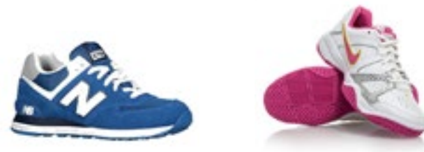
ANY ATHLETIC SHOE WITH A NON-MARKING SOLE