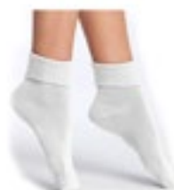
WHITE FOLD OVER