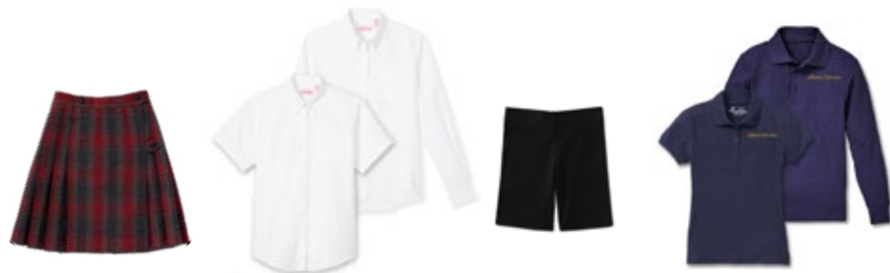
RED/NAVY WRAP AROUND KILT SKIRTS ARE REQUIRED TO TOUCH THE KNEE.*