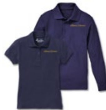
LADIES NAVY SHORT OR LONG SLEEVE POLO SHIRT W/SCHOOL LOGO