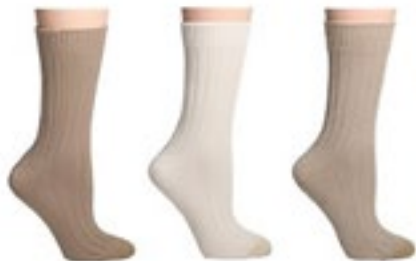
ANY KHAKE SOCKS