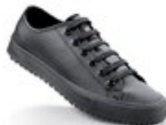
BLACK LEATHER TIE