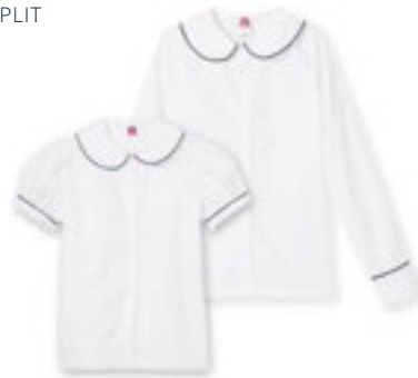
PETER PAN COLLAR WHITE W/NAVY PIPING SHORT OR LONG SLEEVE BLOUSE