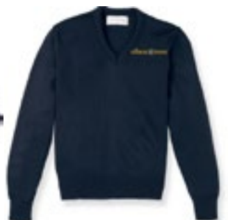
NAVY V-NECK PULLOVER SWEATER W/SCHOOL LOGO