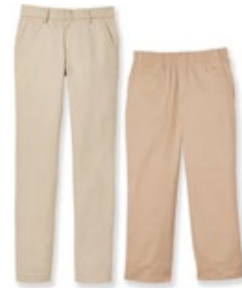
KHAKI TWILL PANTS (ELASTIC WAIST FOR KINDERGARTEN ONLY)