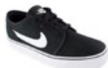
WHITE SOLE OR LARGE LOGO