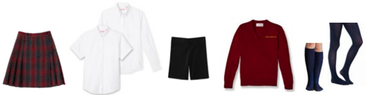
RED/NAVY WRAP AROUND KILT SKIRTS ARE REQUIRED TO TOUCH THE KNEE.*