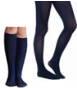
NAVY KNEE SOCKS OR NAVY TIGHTS