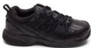
(TIE OR VELCRO) ALL BLACK LEATHER TENNIS SHOE WITH BLACK SOLE