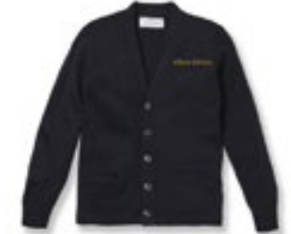
NAVY V-NECK CARDIGAN SWEATER W/SCHOOL LOGO