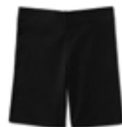
BLACK OR NAVY BIKE SHORTS