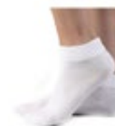
WHITE MID ANKLE