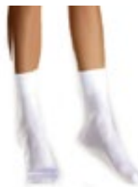
MID CALF FOR K-6