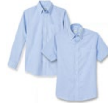
BLUE SHORT OR LONG SLEEVE BUTTON DOWN COLLAR SHIRT