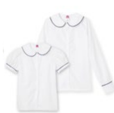
PETER PAN COLLAR WHITE W/NAVY PIPING SHORT OR LONG SLEEVE BLOUSE