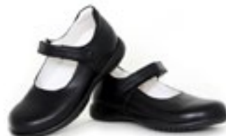
BLACK MARY JANE