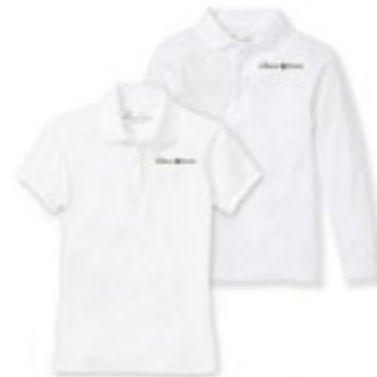
WHITE SHORT OR LONG SLEEVE POLO SHIRT W/SCHOOL LOGO