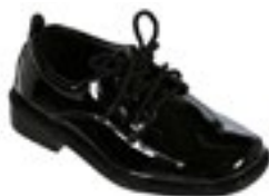
PATENT LEATHER OR SUEDE