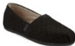
BLACK TOMS OR BOBS WITH A BLACK SOLE