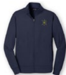
NAVY ZIP JACKET W/SCHOOL CREST (Available for K-12 students to purchase from Educational Outfitters)