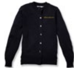
NAVY CREW NECK CARDIGAN SWEATER W/SCHOOL LOGO