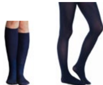
NAVY KNEE SOCKS OR NAVY TIGHTS