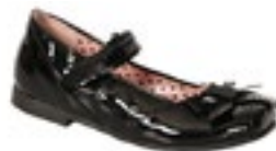
PATENT LEATHER OR SUEDE