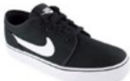
WHITE SOLE OR LARGE LOGOS