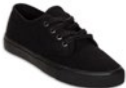
BLACK CANVAS WITH BLACK SOLE