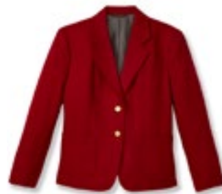
RED WOOL WOMEN'S BLAZER