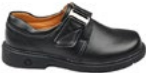
BLACK VELCRO & BUCKLE