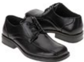
BLACK TIE DRESS SHOE