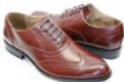
COLOR OTHER THAN BLACK