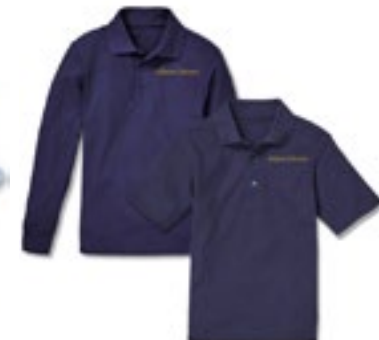
NAVY SHORT OR LONG SLEEVE POLO SHIRT W/SCHOOL LOGO