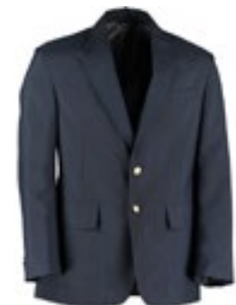
NAVY POLYESTER BLAZER