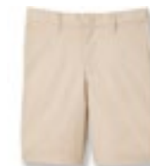
KHAKI TWILL SHORTS (UNTIL FALL BREAK & AFTER SPRING BREAK)