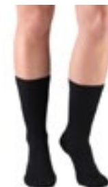
BLACK MID CALF