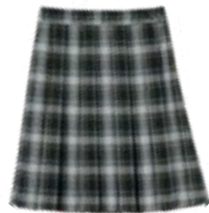
(5TH-6TH ONLY) GREEN NAVY AND WHITE PLAID KNIFE PLEAT SKIRT