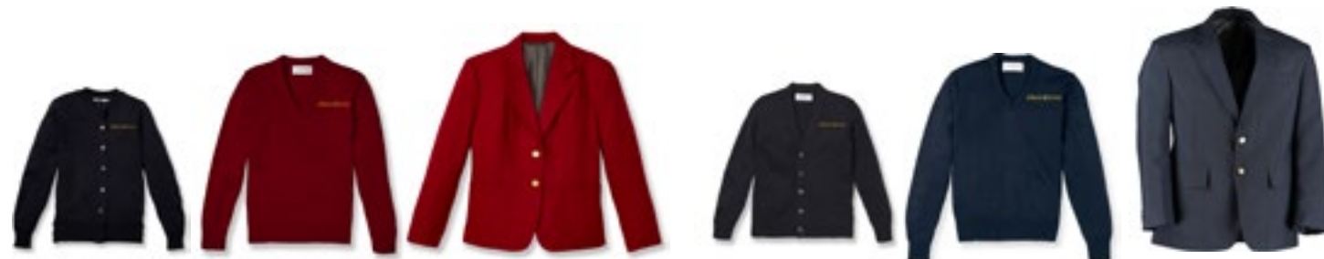
School uniform sweaters and upper school blazers are acceptable outerwear for the classroom on all days of the week. In grades 7-12, Archer athletic and House logowear is acceptable on Fridays after Christmas break, until spring break.