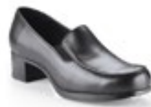
A HIGH HEEL