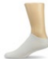
WHITE LOW ANKLE