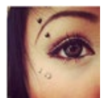
FACIAL PIERCINGS OR IMPLANTS (INCLUDING TONGUE PIERCINGS)