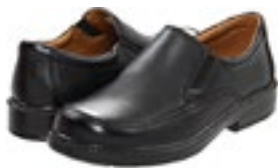
BLACK SLIP ON DRESS SHOE