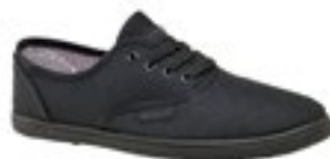
BLACK CANVAS TIE