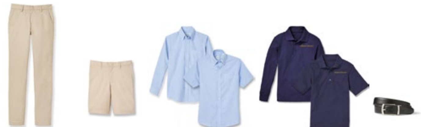
KHAKI TWILL PANTS