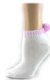
ADORNMENTS OTHER THAN LACE