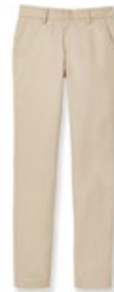
KHAKI TWILL PANTS