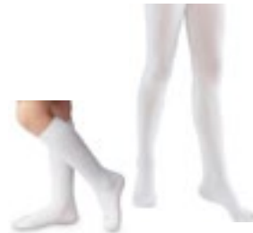
WHITE KNEE SOCKS OR WHITE TIGHTS