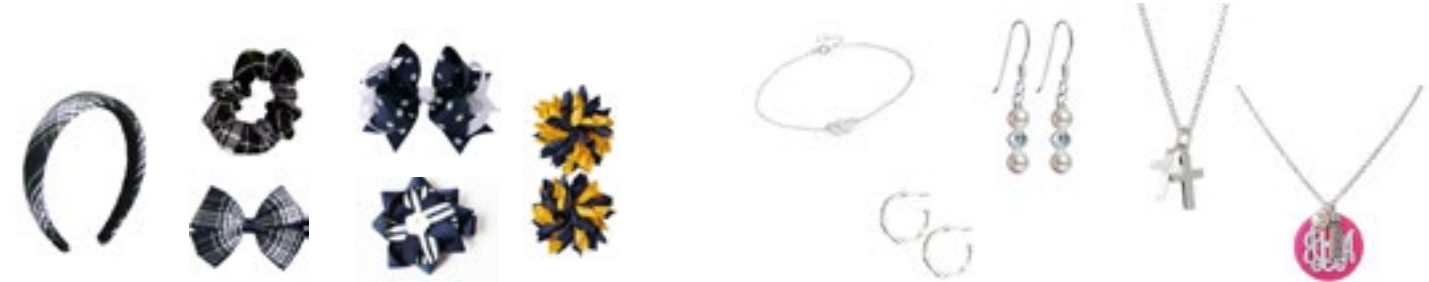
Any hair accessory that is available on the website or that coordinates with the school uniforms is acceptable. If your hair accessory is distracting, your teacher may ask you to remove it. These are a few examples of acceptable hair accessories.